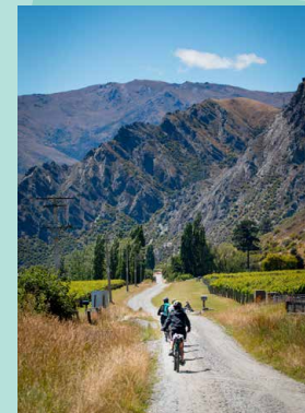
Biking the wineries