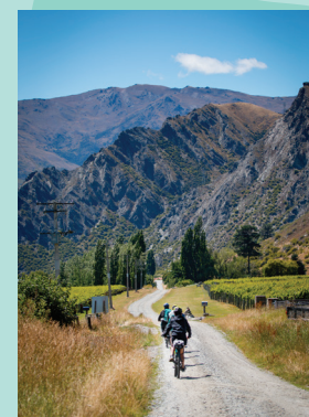
Biking the wineries